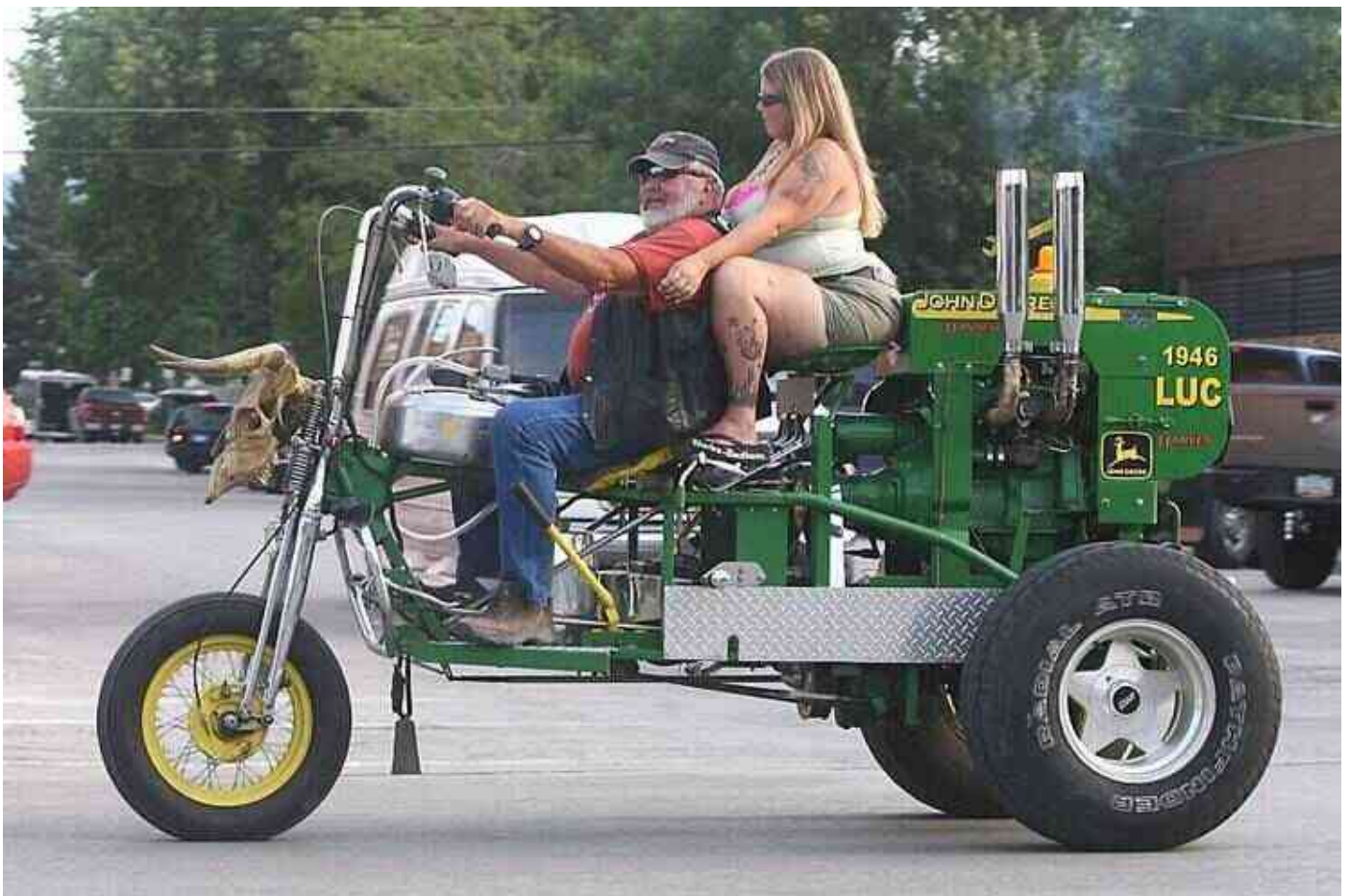
A Ventersdorp Harley-Davidson...