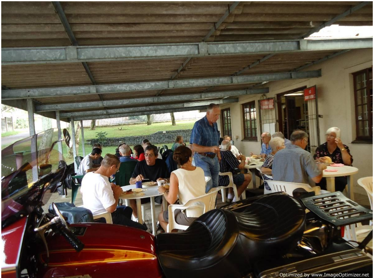
Some of the 37 folks tucking in!